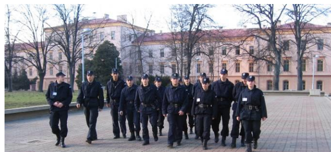
Basic Police Training Centre (BPTC)

BPTC in Sremska Kamenica is the only centre for basic police training in Serbia. The new training system is in effect since 2007.